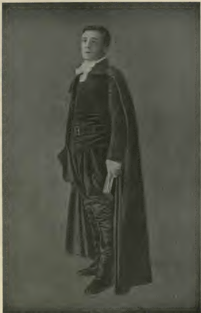
MANSFIELD AS ARTHUR DIMMESDALE